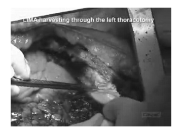
Video 1. Coronary and intracardiac stages of combined procedure: (i) LITA harvesting via LTT. (ii) Semicircular suture mitral annuloplasty (MASS procedure). (iii) Distal anastomoses to coronary arteries. LITA, the left internal thoracic artery; LTT, the left thoracotomy; MASS, the mural annulus shortening suture.